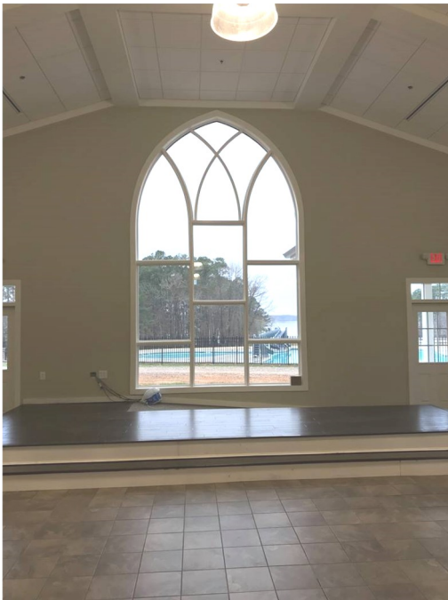
Above: Previous LUMC Fellowship Hall window now has a new home at Camp Willow Springs, Littleton.