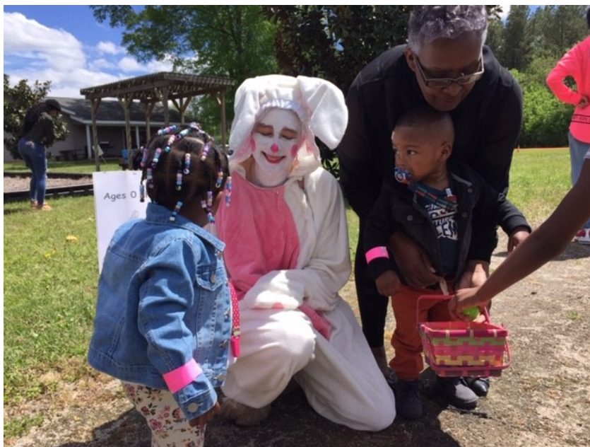
John 3:16 Center Easter Egg Hunt