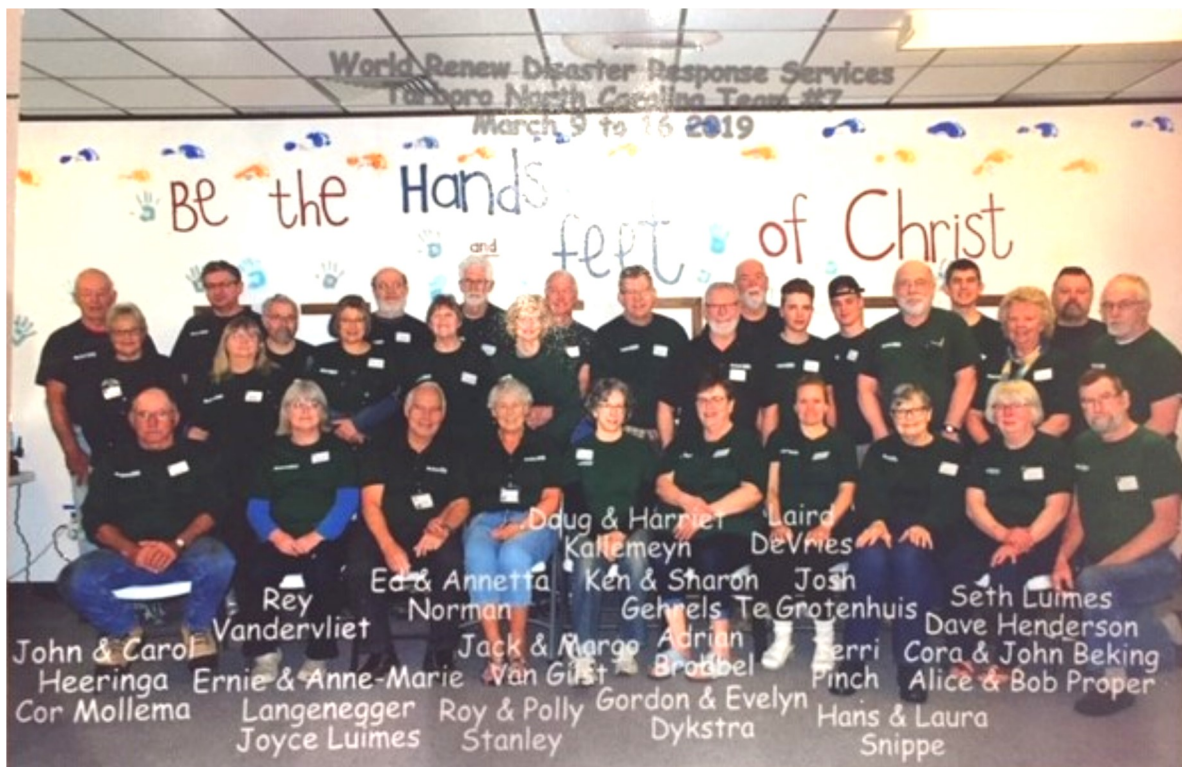
Photo below: Recent visitors - Disaster Response Services volunteers