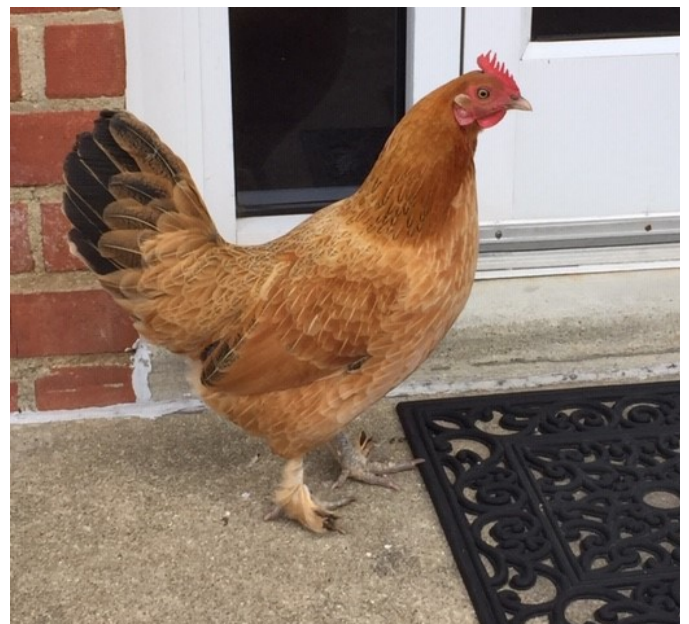
Above: A recent visitor at LUMC. Looking for Easter Eggs???